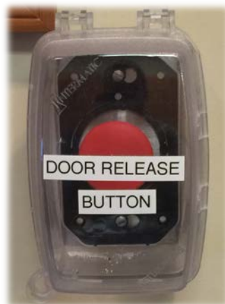
Figure 1.1 “Door Release” Button